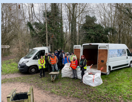
Once collected, the litter was sorted and all the plastic sent to ReAP to be recycled.