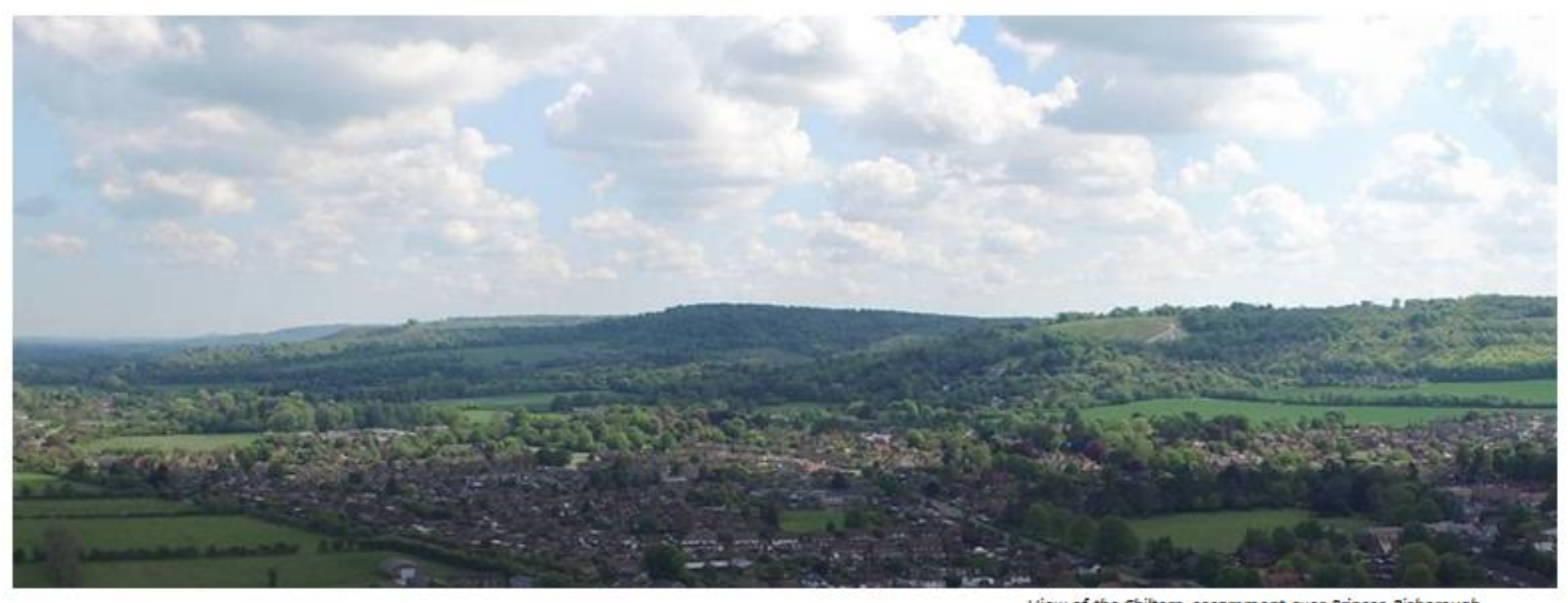
View of the Chiltern escarpment over Princes Risborough.